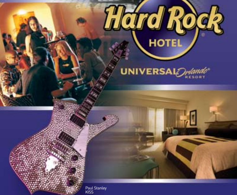
Paul Stanley KISS

Stroll through the hotel grounds and you'll encounter $1 million dollars worth of rare rock memorabilia, from Elvis jumpsuits to clothing and mementos belonging to Elton John, David Bowie, Jimi Hendrix and more. You can let the good times roll with such amenities as: