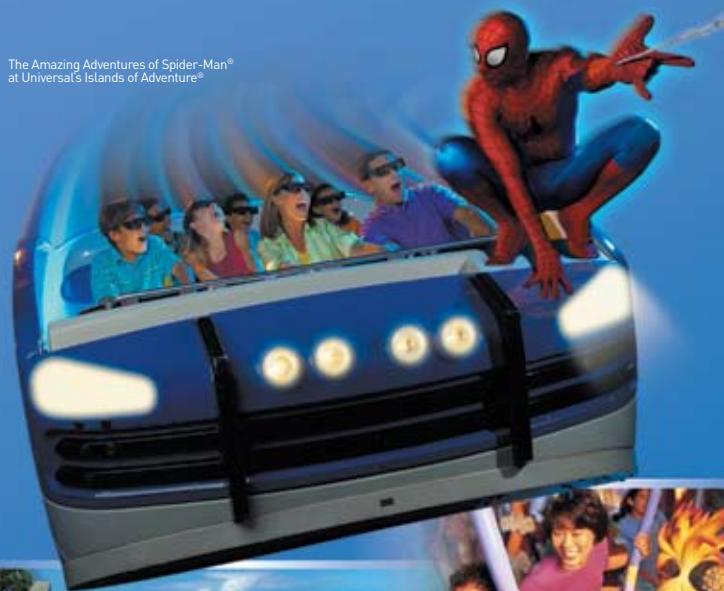
The Amazing Adventures of Spider-Man ® at Universal's Islands of Adventure ®