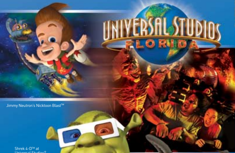
Jimmy Neutron's Nicktoon Blast TM

Go behind the scenes, beyond the screen and jump right into the action of the movies at the number one film and TV based theme park in the world. You'll plunge into darkness on Revenge of the Mummy SM ; see, hear and feel the action in the hilarious Shrek 4-D TM ; soar through Nickelodeon cartoon worlds on Jimmy Neutron's Nicktoon Blast TM ; zap aliens on the interactive ride MEN IN BLACK TM Alien Attack TM and help save mankind in the futuristic TERMINATOR 2 ® : 3-D .